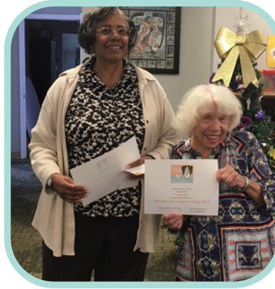
Computer Class Achievements