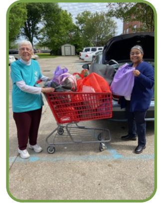
Easter Gifts for Pine Street Neighbors