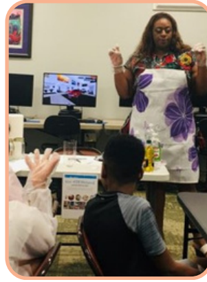
After School STEM