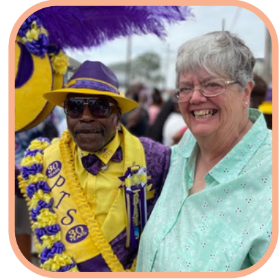
Easter Celebration for Gert Town Neighbors