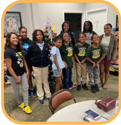
After School Reading Group with Xavier Volunteers