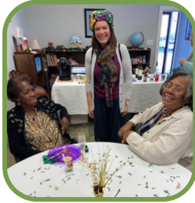
Volunteer Appreciation Party