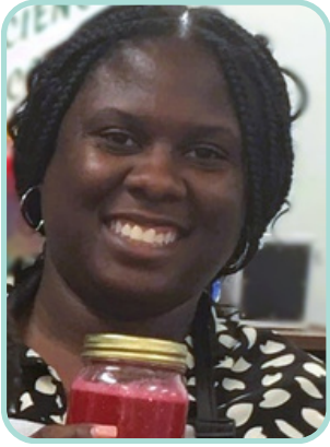
Play Therapy Fun