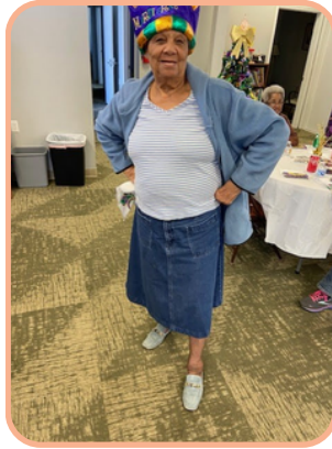
Mardi Gras Queen 2024